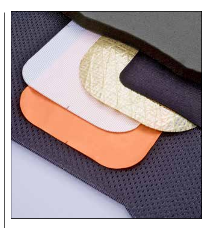
The Elektron Laser ZP cut most synthetic fabrics quickly, accurately and with minimum edge discolouration.